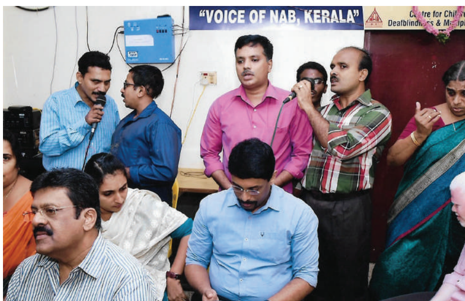
The music team of NAB Kerala